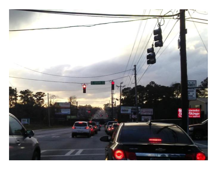
Figure 1 - Traffic backup on Baytree Road during afternoon commute from Norfolk Southern Railroad Crossing