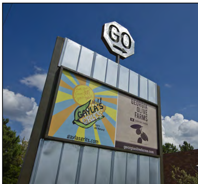
Pictured above: Georgia Olive Farms, Lakeland, GA

In addition to practicing physical distancing and wearing facemasks, continuing and even increasing outdoor activities during the upcoming colder weather and flu season is advised. The shelter-in-place order in Georgia took not only an economic toll, but also exacerbated mental health and substance abuse issues. If people spend more time outdoors this winter, they will not only be exposed to fresh air and sunshine but will also experience greater ventilation and