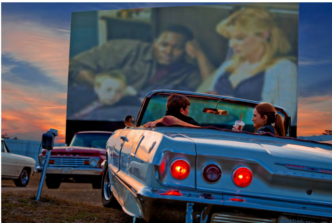
Drive-in Theater, Jesup, GA

For additional details and localized assistance, SGRC Planning staff are available at (229) 333-5277.