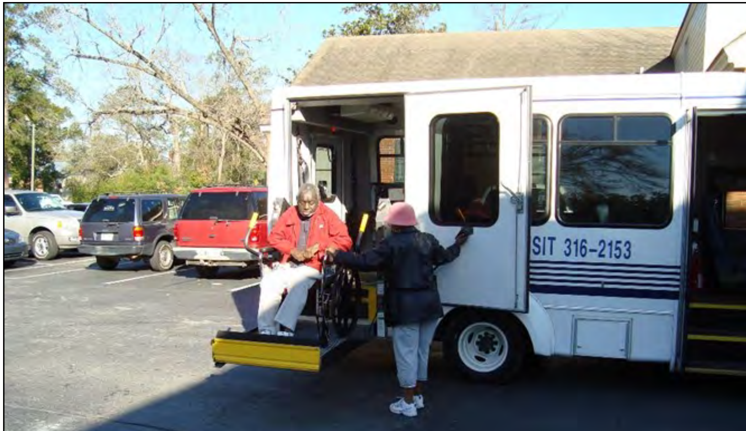
Pictured above: a participant gets a ride from a regional transit provider.