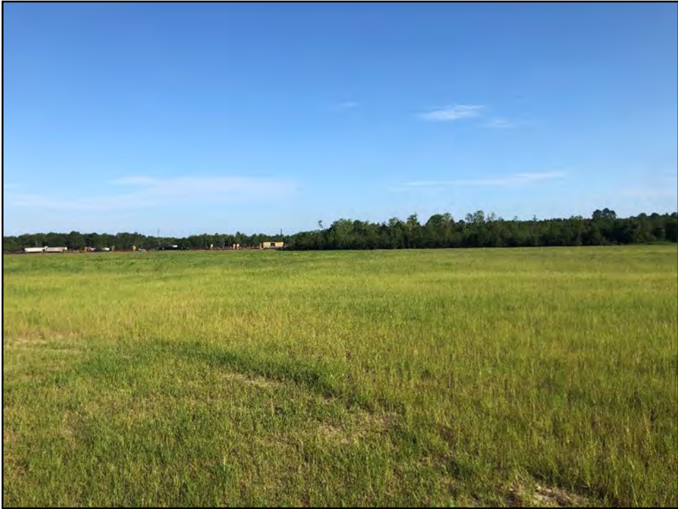
Site of future rail spur in the Pierce County Industrial Park.