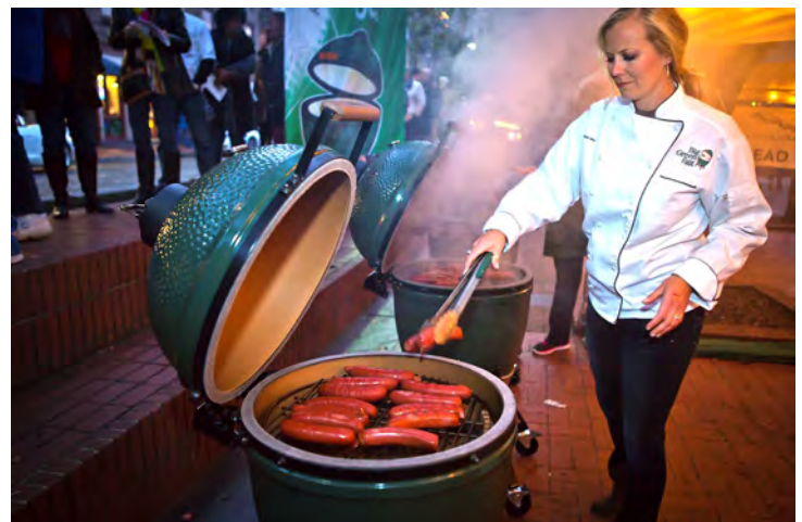
Pictured above: Wine & Food Festival picture of Big Green Egg