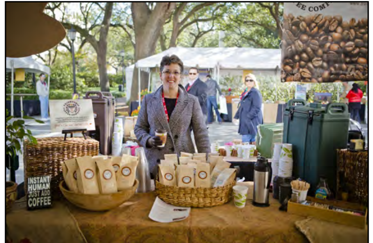
Pictured above: Wine & Food Festival picture of Friendship Coffee Company