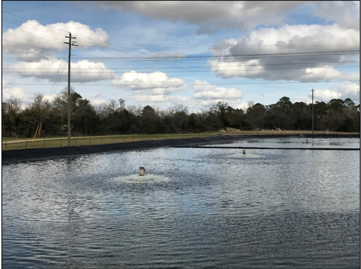
City of Sycamore Wastewater Treatment Facility