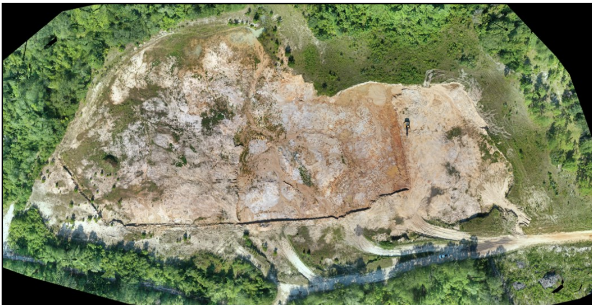
Thomas County Sand Pit project: UAV aerial photo of sand pit.