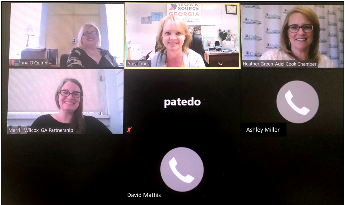
Pictured above are participants in the recent Region 11 Chamber Check-In event, held via Zoom.