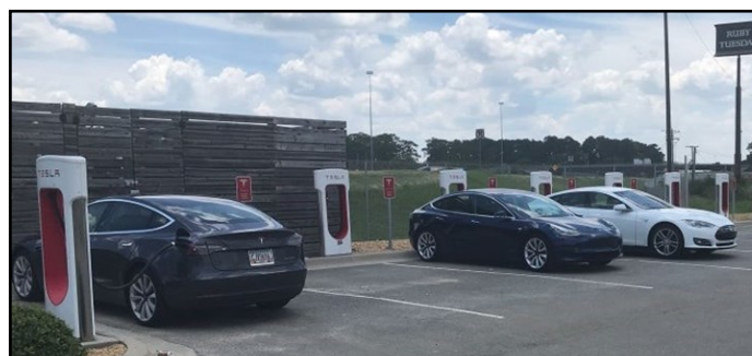
Pictured above: Tesla EV charging stations in Tifton

Some localities install EV charging stations and do not charge a user fee. This benefit can be a powerful incentive to visitors and travelers to stop in those localities especially if EV owners notice restaurants, coffee shops, etc. to visit while stopping to charge their EV.