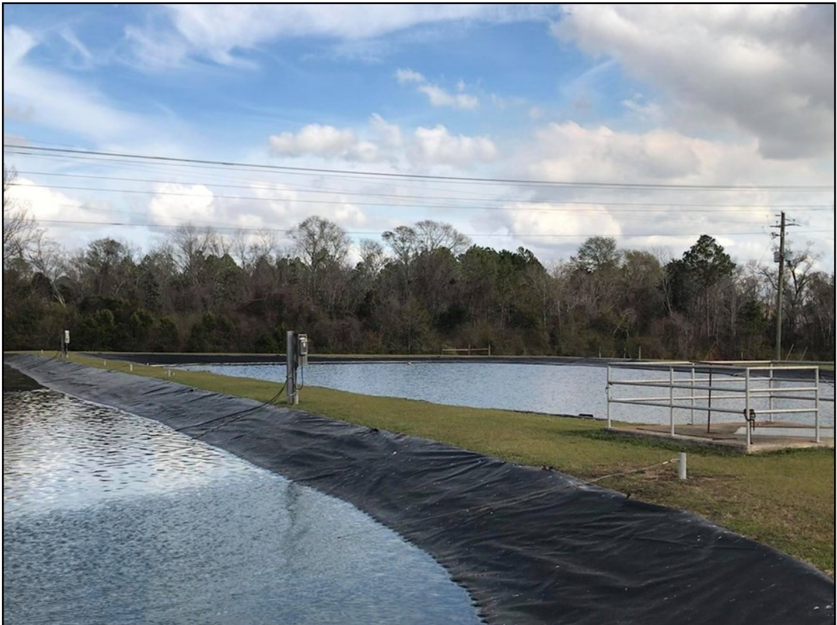
City of Sycamore Wastewater Treatment Facility

The successful EDA grant application was written and submitted by the Southern Georgia Regional Commission. SGRC Community and Economic Development staff will administer the project.