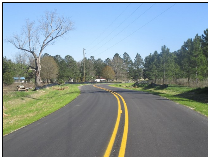
Legg Road Before and After