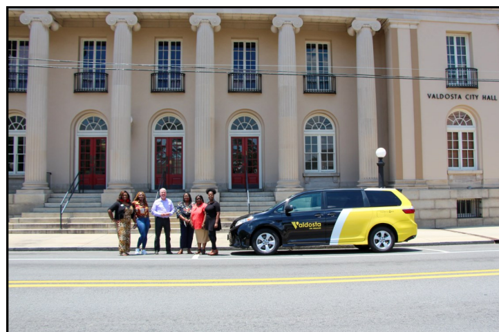
Pictured above (top) WIOA staff at Wiregrass Technical College and (bottom) WIOA staff at Valdosta City Hall