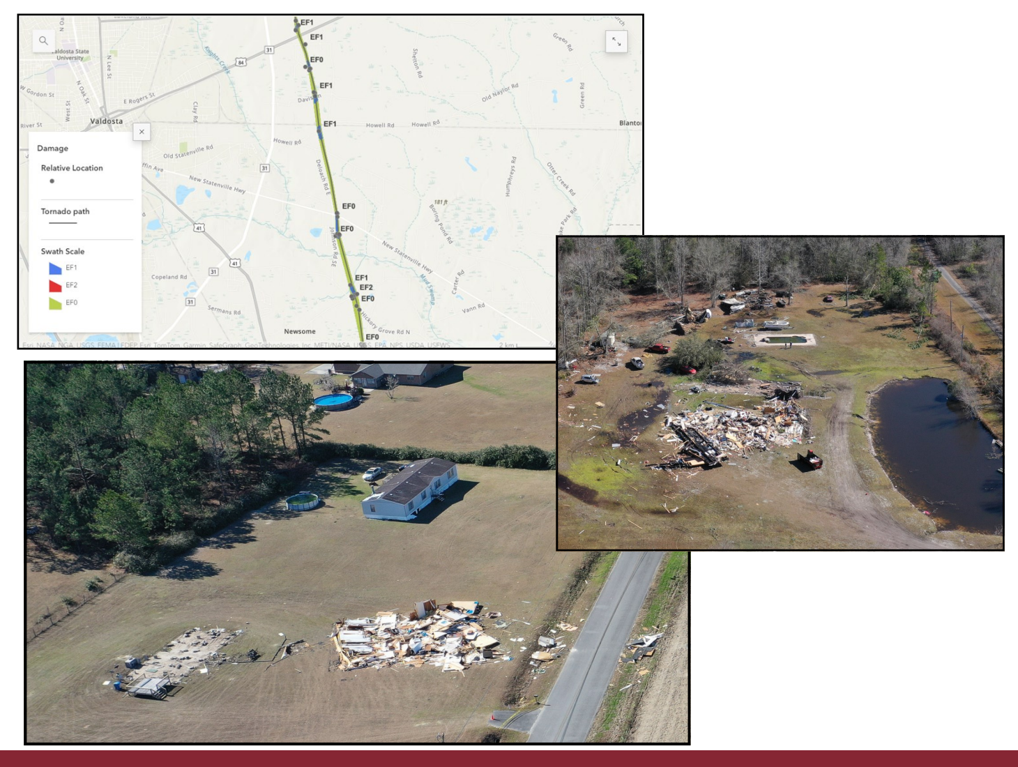
Regional Services • Community Focused

Lowndes County Tornado https://storymaps.arcgis.com/stories/c7b8ab0e1e2a49a5b4883b1be2368775