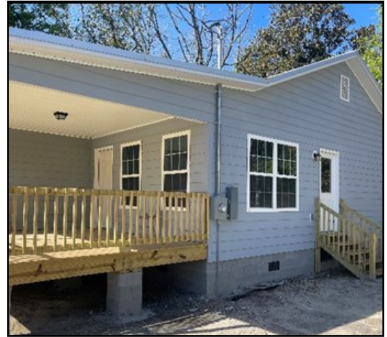
Reconstruction After Photo #2