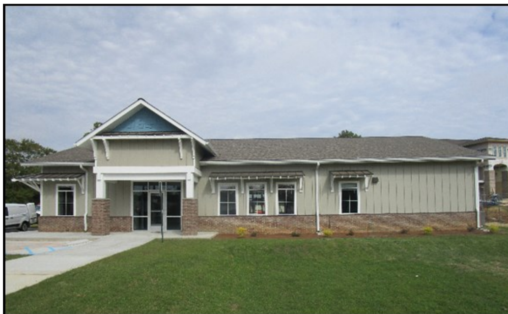
Public Facility Improvements