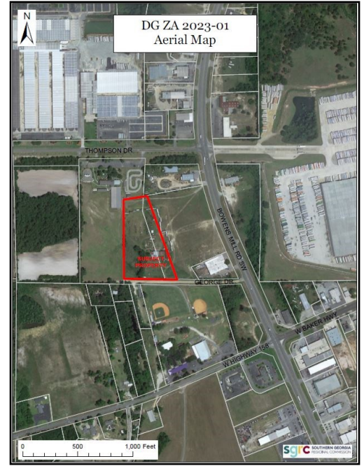
SGRC-GIS Aerial Map