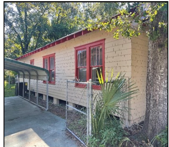
Rehabilitation After Photo #1