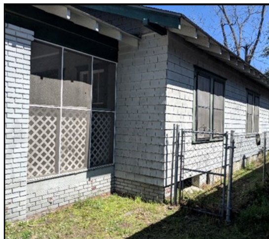
Rehabilitation Before Photo #2