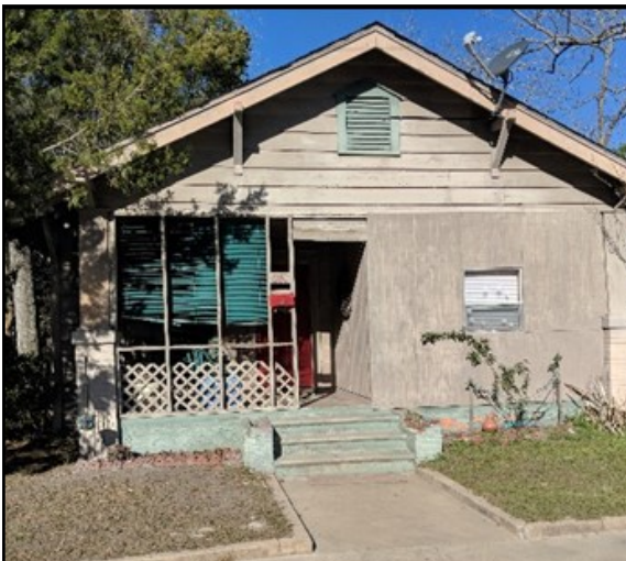
Reconstruction Before Photo #1

The reconstruction consisted of the demolition of an existing dilapidated home and reconstruction of 1,190 square feet - 3 bedroom, 2 bath home for an elderly woman and her grandchild. One rehabilitation project consisted of a 1,400 square foot 3 bedroom and 2 bath home for a senior citizen.