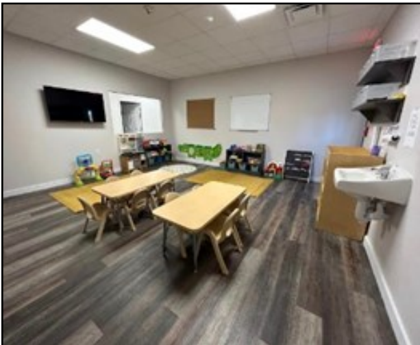
Nurtured Roots Learning Center classroom