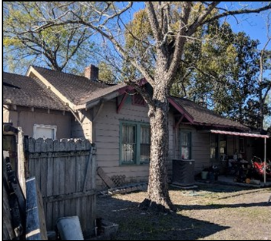
Reconstruction Before Photo #2