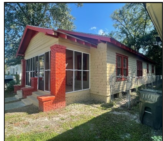
Rehabilitation After Photo #2