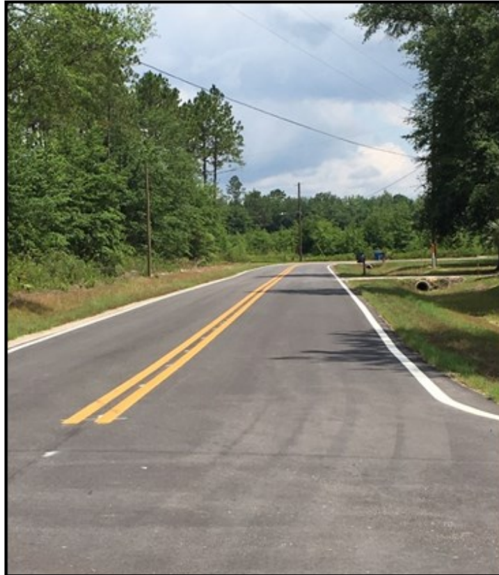
Street, Flood, and Drainage Improvements

SGRC Community Economic Development Division Reminds City and County Governments of CDBG Planning Time (continued)