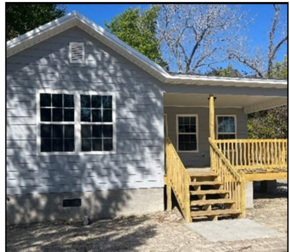
Reconstruction After Photo #1