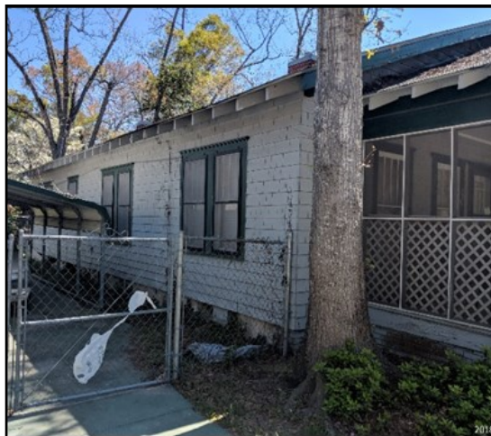
Rehabilitation Before Photo #1