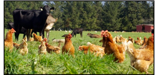
Rural scene with cows and chickens

It is time to start planning for the Rural Zone Designation's August 2024 deadline. To be eligible, communities must have a population of 15,000 or fewer, have a concentration of historic commercial structures, and must be economically distressed as defined by the Georgia Department of Community Affairs. Additionally, communities should comply with the state requirements, submit a feasibility study or market analysis, and must submit a master plan or strategic plan.