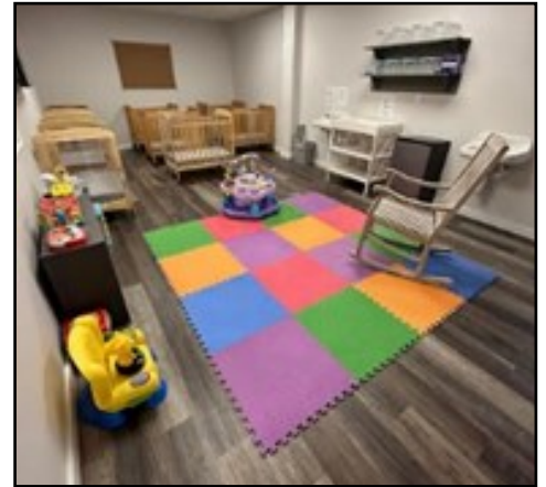
Nurtured Roots Learning Center playroom

Nurtured Roots Learning Center is a childcare facility located at 518 S. Elm St. in Adel that accommodates children from infancy to preadolescents. The center is staffed with qualified employees who not only serve as facilitators but also as teachers. The education curriculum is based on the principle that preschoolers learn and develop best through carefully supervised play with educational materials. Their goal is to create a learning atmosphere that will provide stimulating experiences along with challenging materials for the children to learn in the best possible environment. The mission is that every child will have the opportunity to grow emotionally, socially, intellectually, creatively, and physically in a safe and controlled setting to provide the children with the best possible learning experience. The facility has a capacity to serve 71 children.