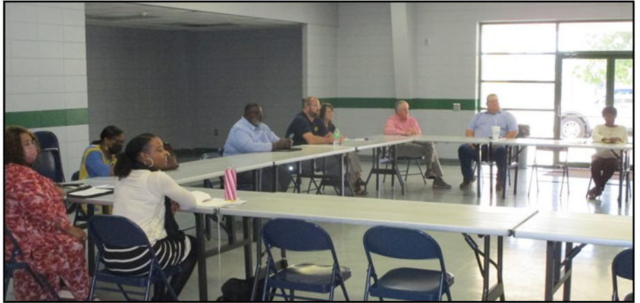
Participants of the Pre-Comprehensive Plan Update Workshop