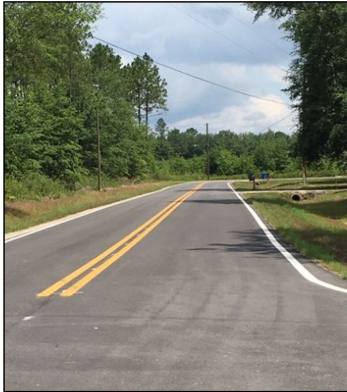
Street, Flood, and Drainage Improvements

SGRC Community and Economic Development Division Reminds City and County Governments of CDBG Planning Time (cont.)