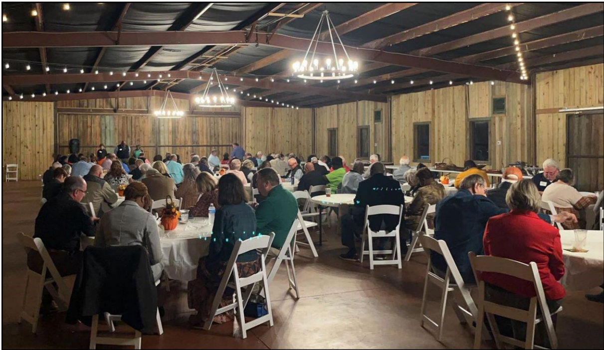
The 2022 SGRC Area Officials Appreciation Dinner at The Farm in Adel