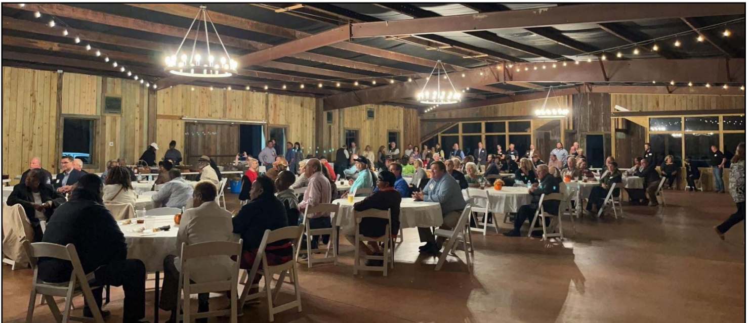
The 2022 SGRC Area Officials Appreciation Dinner at The Farm in Adel

On November 9, the SGRC hosted the very well-attended 2022 Area Officials Appreciation Dinner at The Farm in Adel. Attendees enjoyed good food in a relaxed atmosphere during the annual evening of fellowship. The SGRC is grateful for its partnerships with community leaders and looks forward to future collaboration and cooperative work to benefit the region.