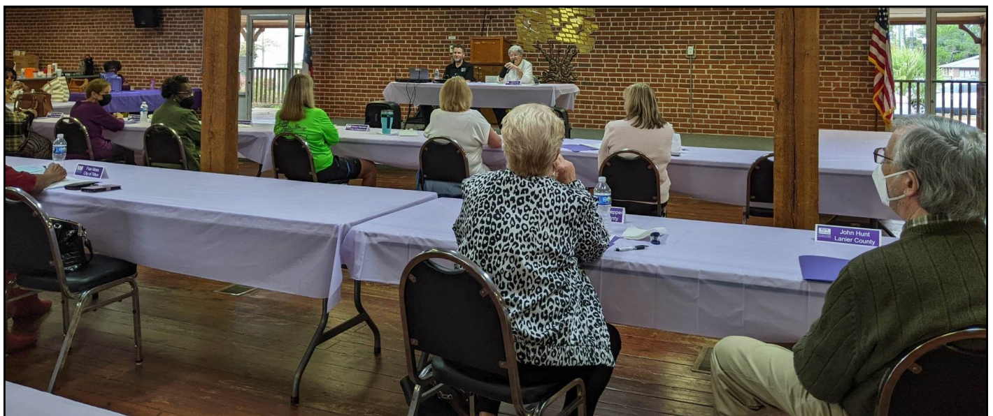
Aging Advisory Council Meeting November 9 in Nashville at the Nashville Community Center