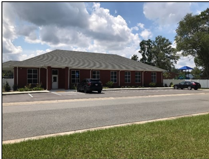
Public Facility Improvements