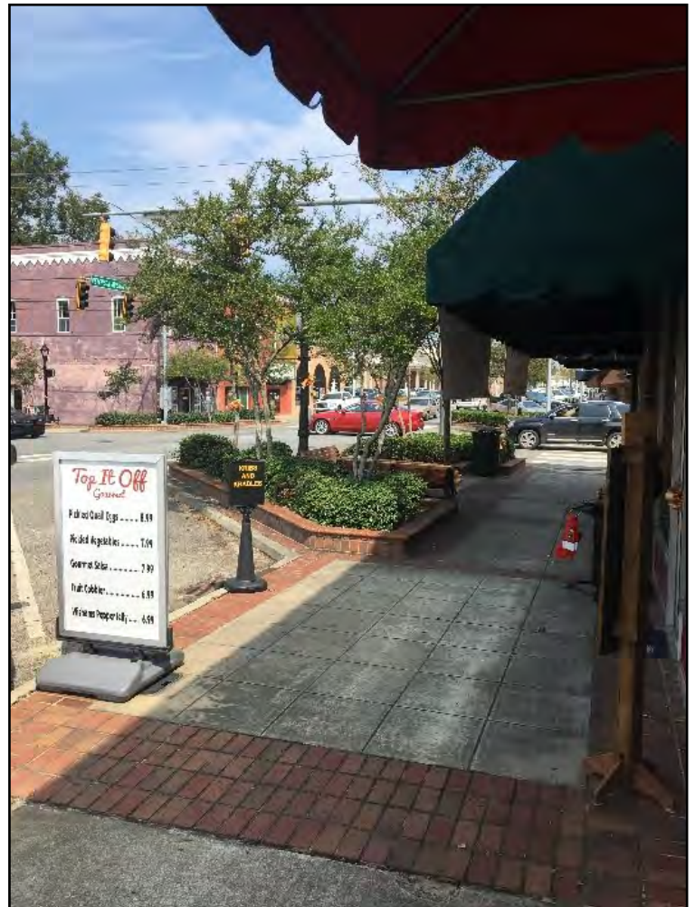
Sidewalk in Douglas, Georgia

The plan also includes analysis the demographics of project areas, the crashes that have occurred involving pedestrians, and the distribution of projects among City Council districts. The Appendix (of the plan) includes examples of pedestrian safety outreach materials and a model Complete Streets policy developed for the City of Douglas. An interactive map was developed on which community members could vote on proposed sidewalk projects and suggest new projects. Additionally, open discussions