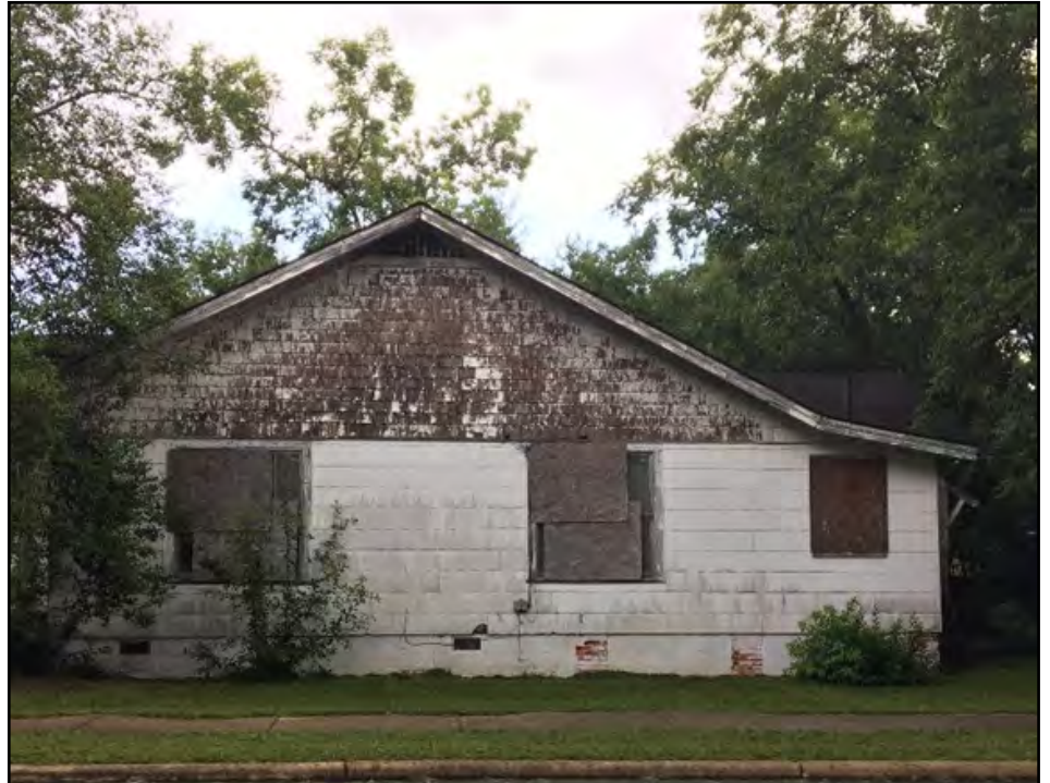
Pictured above is a structure surveyed in the city of Douglas

The SGRC Planning Division staff is currently developing an Urban Redevelopment Plan (URP) for the City of Douglas. Thanks to Georgia's Urban Redevelopment Act (O.C.G.A. § 36-61-1), a URP gives local governments broad powers to redevelop blighted areas using code enforcement and eminent domain. Covering the entire City, the URP will function as a guiding document for the redevelopment and targeting of public investments throughout the redevelopment area. Among many other advantages, an URP permits the use of tax-exempt bonds for redevelopment purposes.