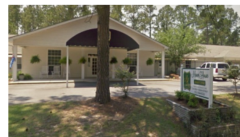
The Landings of Douglas 1360 W Gordon St 912-384-6522