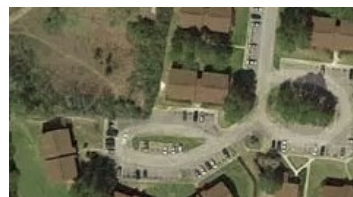
Georgian Woods Apartments 120 McNeil Dr 912-384-3233

The locations below provide safe, affordable housing for seniors in Douglas, Georgia.