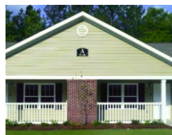
Pine Meadows 1315 W Gordon St 912-383-7070