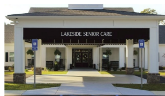
Lakeside Senior Living Center 1025 N Chester Ave 912-501-3373