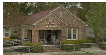
Southern Senior Living 215 E Sellers St 912-383-9883