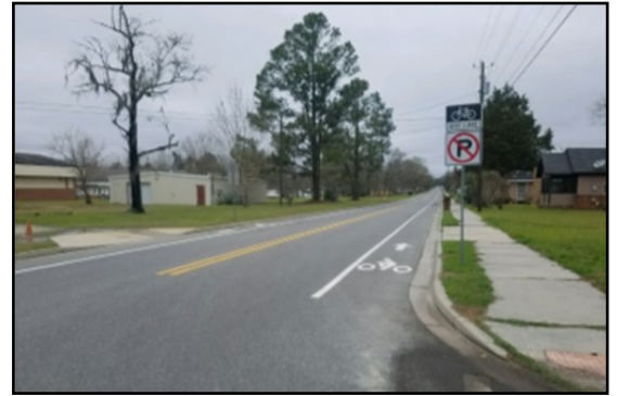
Pinevale Community in Valdosta

The Southern Georgia Regional Commission is wrapping up a community report for Valdosta's Pinevale community on behalf of the Valdosta-Lowndes Metropolitan Planning Organization. This report provides an overview of the community's overall demographics and transportation infrastructure. The Pinevale community is a historic community that is idyllic for housing and infrastructure rehabilitation and revitalization initiatives. This community report is comprised of data from staff site visits, the U.S. Census, ESRI, and future year 2045 Socioeconomic Data.